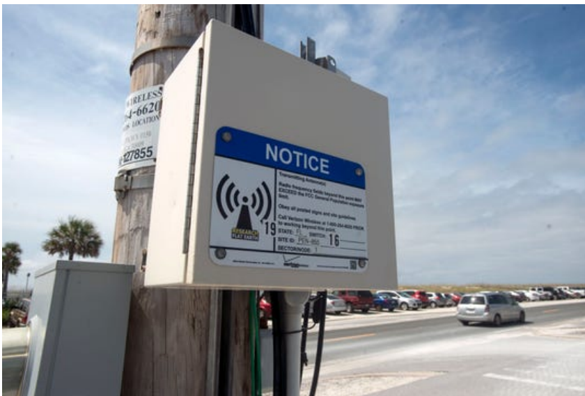
A 5G small cell transmitter is pictured outside Peg Leg Pete's on Fort Pickens Road.

A Verizon spokeswoman told the News Journal last week that the company is making every effort to co-locate on existing poles.